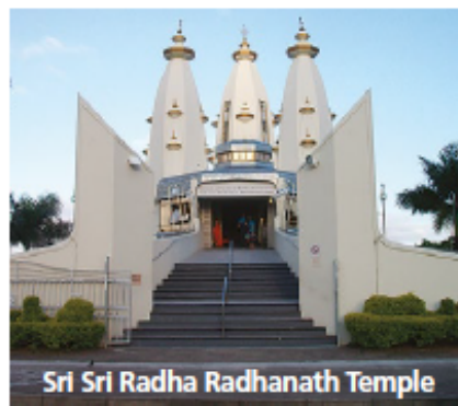
Sri Sri Radha Radhanath Temple