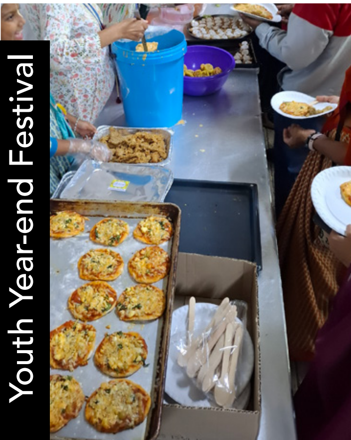
Youth Year-end Festival